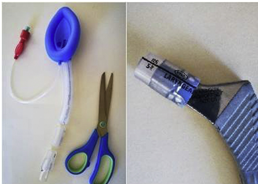
Figure 1. Silicon laryngeal airway #5 and its cut segment applied to the femoral taper.

We consider that the aforementioned procedure is an inexpensive and simple solution for the complicated problem and strongly recommend to be used during all liner exchange and acetabular cup-only revision total hip replacement surgeries.