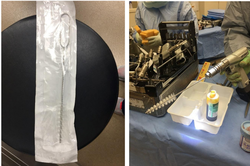
Figure 1. Chucked femoral canal brush.

appropriately and to allow the surgeon to evaluate the soft-tissue balance. We typically use cruciate-retaining polyethylene trials, even if a posterior-stabilized final implant is intended, to allow for a better assessment of balance.