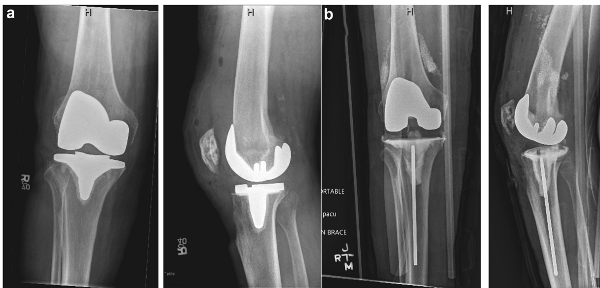
Figure 3. (a) Preoperative anteroposterior and lateral radiographs of a patient with a right total knee periprosthetic joint infection. (b) Postoperative radiographs of a right knee after placement of an articulating antibiotic spacer. Note that cruciate-retaining components were used, as the patient had a functional posterior cruciate ligament. Absorbable antibiotic beads (STIMULAN; Biocomposites, Wilmington, NC) can also be appreciated.

This technique has shown excellent short-term outcomes and promising midterm results. In evaluating 31 chronic PJI cases treated with 1.5-stage exchange TKA using a cobalt–chrome femoral component and an all-polyethylene tibial component, Hernandez et al. [28] noted a 16% reimplantation rate and a 90% PJI eradication